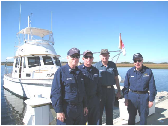
Towing drill at Mayport with the Coast Guard, January 19

14-1 crew Casey, DeBrauwere, Durden, Fridrich