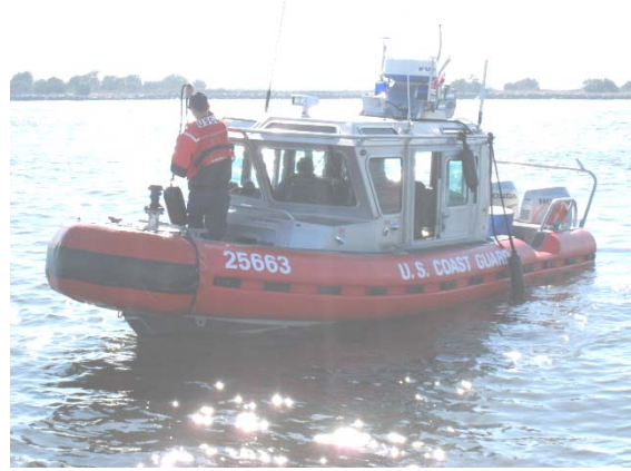
Coast Guard boat at Mayport. January 19

14-1 crew Casey, DeBrauwere, Durden, Fridrich