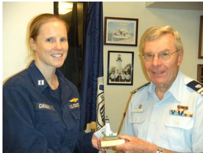
January guest speaker Lt Carbine from the Helicopter Interdiction Squadron at Cecil field